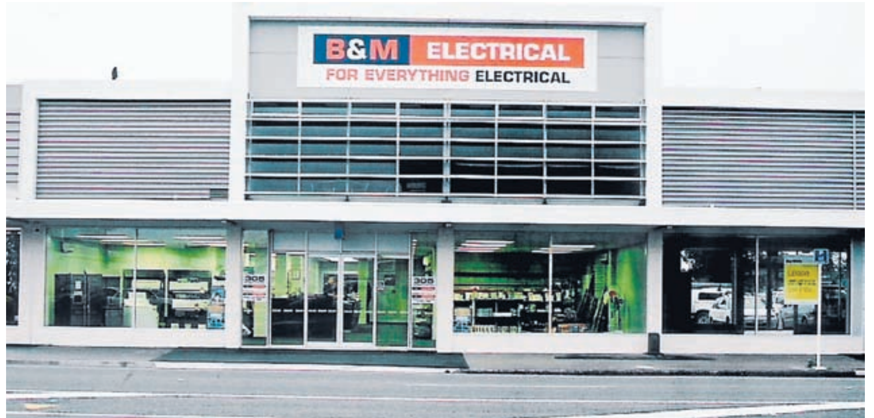
Sparkling new: The new B&M Electrical is highly visible on Rangitikei Street, and offers ease of access for service and delivery vehicles at the rear of the building.

as an experienced service agent and as a reliable source of spare parts for most major-brand appliances.