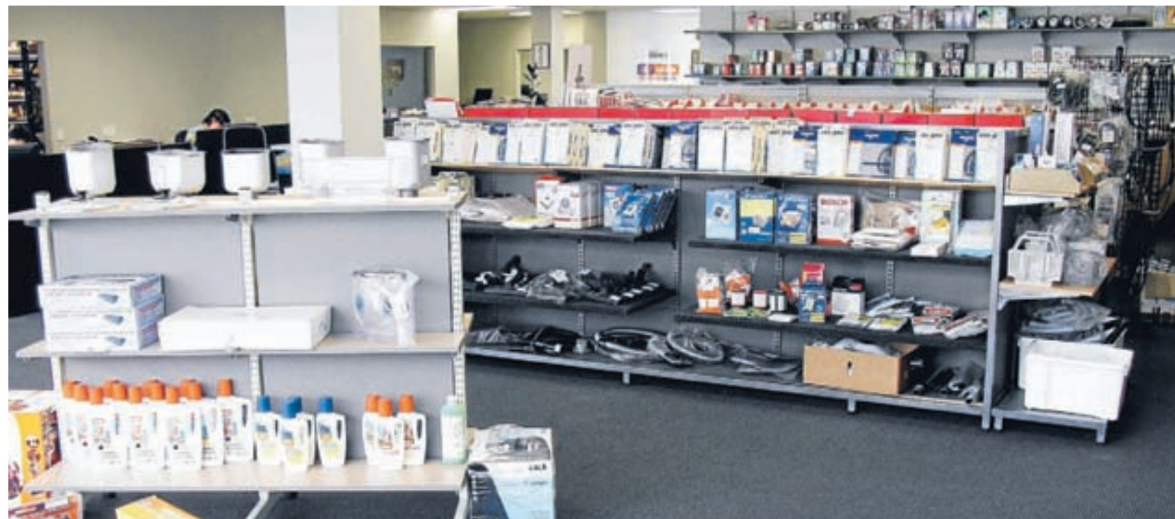
Showroom: B&M Electrical stocks, or can source, an extensive range of spare parts for appliances and many hard-to-find lightbulbs.